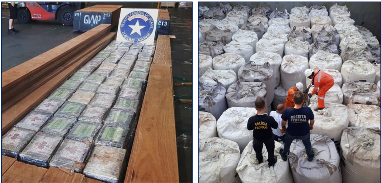
Picture 4: (left) drugs concealed in plywood shipment; drugs in bagged cargo.

Smugglers also conceal larger amounts of illegal substances with or within any cargo (breakbulk, solid bulks, vehicles), provisions, spare parts, and in any compartment on the vessel's deck, cargo holds, tanks, machinery space and crew quarters for subsequent collection ashore, with the necessary assistance of corrupt port workers or officials. Picture 4