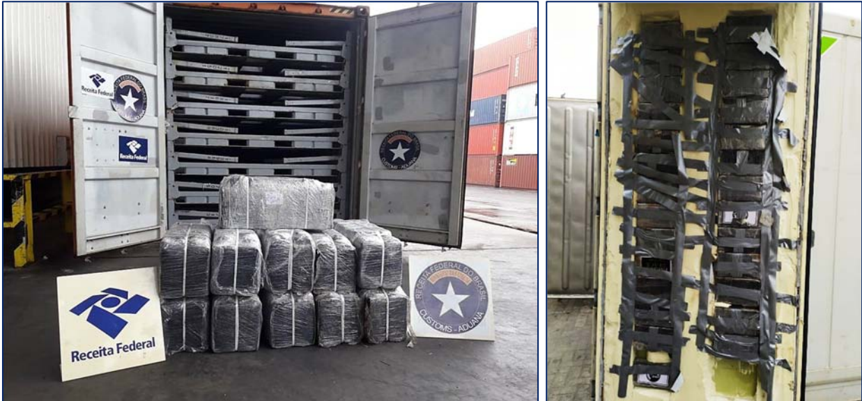
Picture 1: (left) drug concealed within the load; drug inserted in container door.

The most common modus operandi for smuggling drugs in containers out of Brazil is the "rip-on/rip-off" method, whereby the cocaine is loaded into the cargo unit at the port of departure and is recovered at the port of destination without the knowledge or cooperation of the shipper, consignee and carrier. It requires corruption of hauliers or port workers at both ends and involves tampering with the original seal, which is usually replaced or repaired to disguise obvious violation.