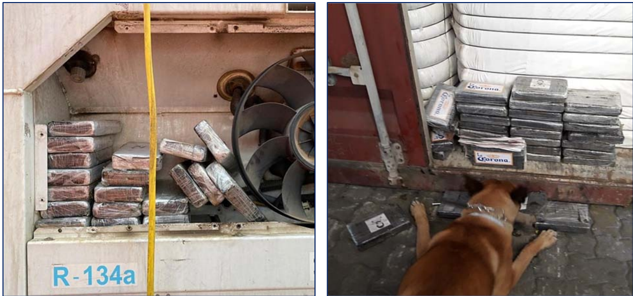
Picture 3: (left) Packages of cocaine found by Customs sniffer dogs.

The figures for 2020 are not yet complete but believed to exceed an estimated 15 tonnes in Santos. Antwerp, Rotterdam, Valencia, Le Havre and Hamburg are among the top ports of destinations for the boxes intercepted, packed with a wide variety of legitimate goods. The police considered they were rip-on/rip-off cases without the participation of shippers or carriers. People were caught in the act in only two of these incidents.