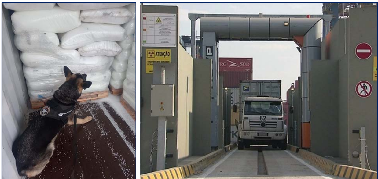
Picture 2: (left) Customs sniffer dog in action; a container goes through a scanner.

Drugs are often hidden or incorporated into legitimate cargo shipments, typically involving the cargo owner, packers or port workers. They may also be concealed in the structure of dry containers, such as corner posts, rails, floorings, and into cooling compartments and insulation of walls and doors of refrigerated ("reefer") containers. Picture 1