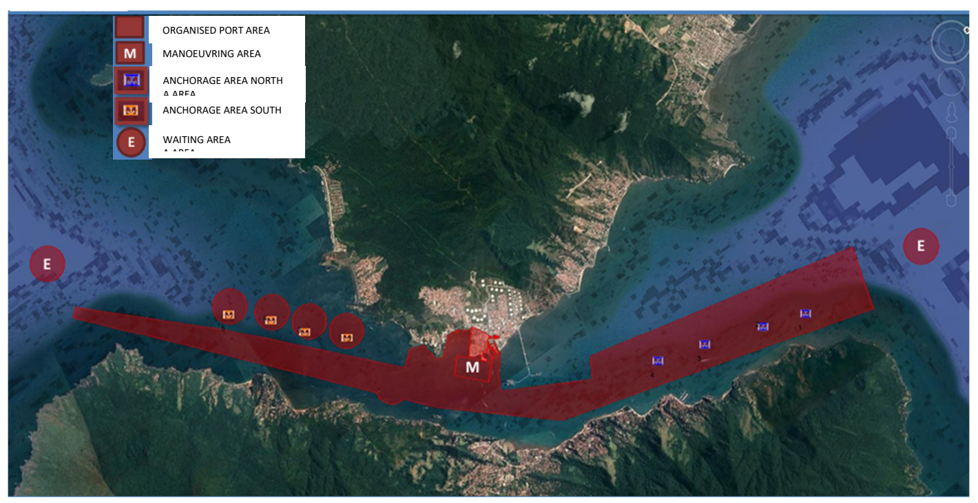
Picture 2: Map featuring anchorage points in the Organised Port of São Sebastião.

An interactive map of the Anchorage areas of the Port of São Sebastião s available at this link. (Requires Google Earth).